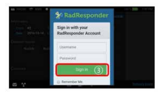
Log In with RadResponder Credentials