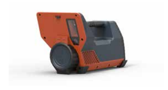
Model SAM 950 Ruggedized Isotope Identifier