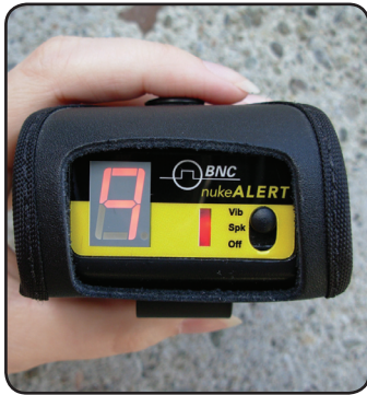
The unit fits inside a protective pouch and clips conveniently to the user's belt for hands-free operation.

The nukeALERT 951 is the essential radiation detector to disclose the presence and intensity level of gamma radiation for nontechnical personnel. It's small, rugged, watertight and more sensitive than commonly used first responder radiation meters. Enhanced sensitivity is especially important when monitoring an area for concealed radioactive material, where the radiation levels may vary based on distance and shielding.