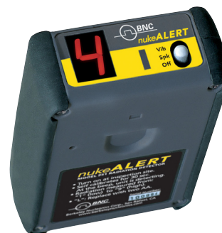
nukeALERT Model 951

Public Safety Officers (Federal, State, Local), First Responders, Border Patrol, HAZMAT Teams, Cargo Inspectors, Radiation Safety Officers, Military Forces